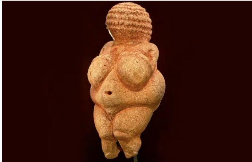
Figure 2. Venus of Willendorf (artincontext, 2023)

woman who has a large stomach, large thighs, big breasts, and a detailed carved upfront pubic region. The other parts of her body are not carved, including the face of the sculpture. The shape of the sculpture symbolizes fertility and nurture (Seshadri, 2012). There is no accurate evidence of the meaning of the sculpture. However, according to the literature, this figurine symbolizes the ideal and attractive woman's body in the Paleolithic Era in terms of supporting fertility and having good parental behaviors, which supports the human instinct regarding reproduction.