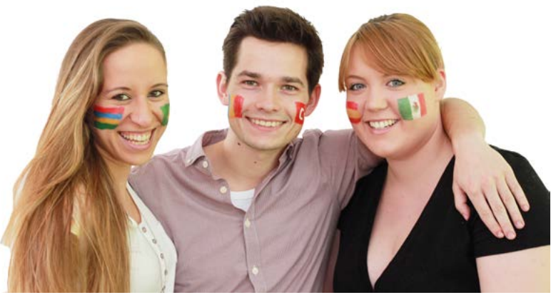
Figures based on a June 2017 analysis of MODUL University MBA students and graduates