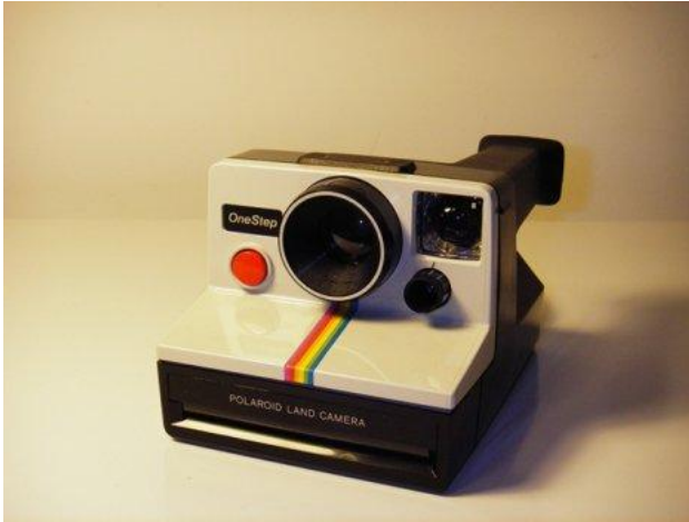
Image 3 Polaroid Camera ( http://commons.wikimedia.org/wiki/File:Polaroid_OneStep.jpg , Accessed: June 9 th 2013)