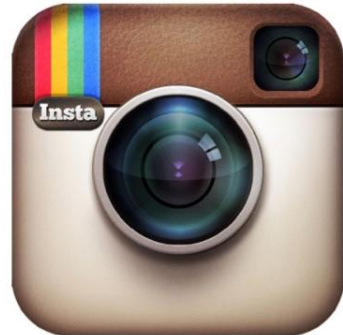
Image 7 Instagram Logo ( http://news.softpedia.com/news/Instagram-for-Windows-Phone-Now-Rumored-for-a-June-26-Release-358882.shtml ) Accessed: (June 9th 2013)