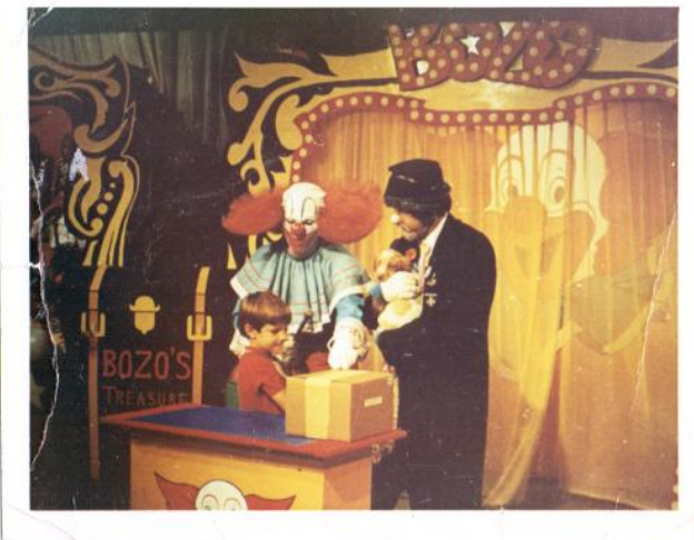
Image 6 Instamatic Photo, Worcester, MA, 1970