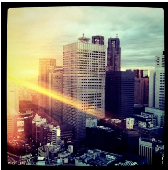
Image 8 Instagram Picture from @NatGeo ( http://weblogit.net/wp-content/uploads/2012/12/Instagram-Fotos.png ) Accessed June 9th 2013)