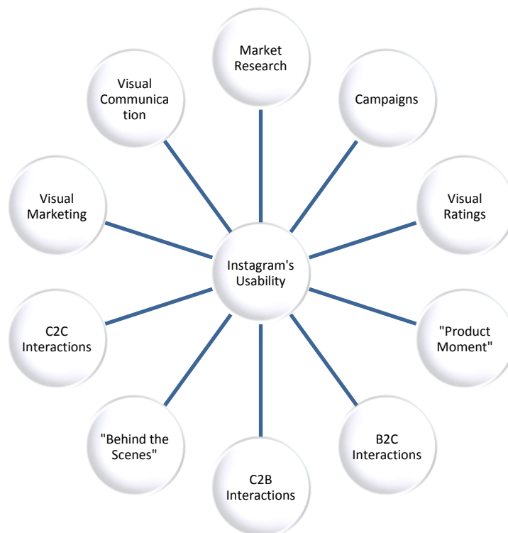
Figure 3 Instagram's User Synopsis