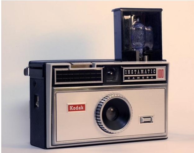
Image 5 Instamatic Camera