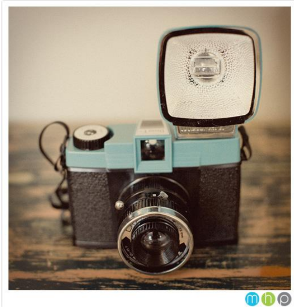
Image 1 Lomography Camera: Diana F+