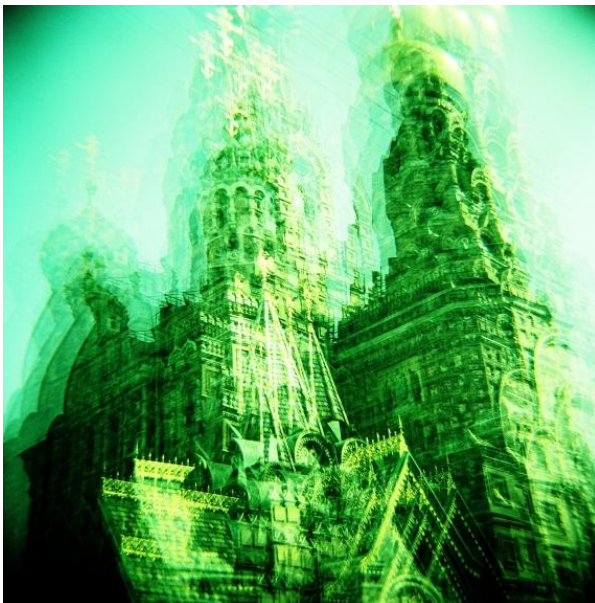
Image 2 Photo taken with Diana F+ Walking on the roof with @palkina and @zaruki_zanogi Taken by masha_njam ( http://www.lomography.com/photos/18468788 , Accessed: June 9 th 2013)