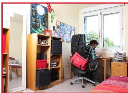
Wihast Standard Dorm Room