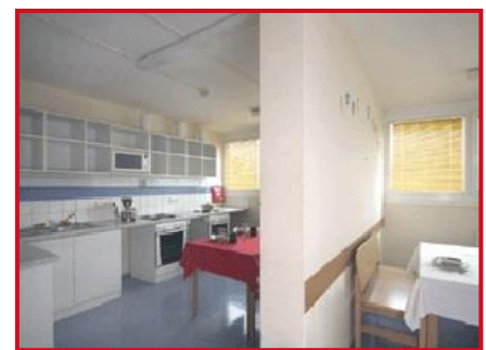
Wihast Communal Floor Kitchen