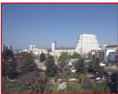
20th District Complex Exterior

Address: Brigittenauer Lände 224-228, 1200 Vienna, Austria