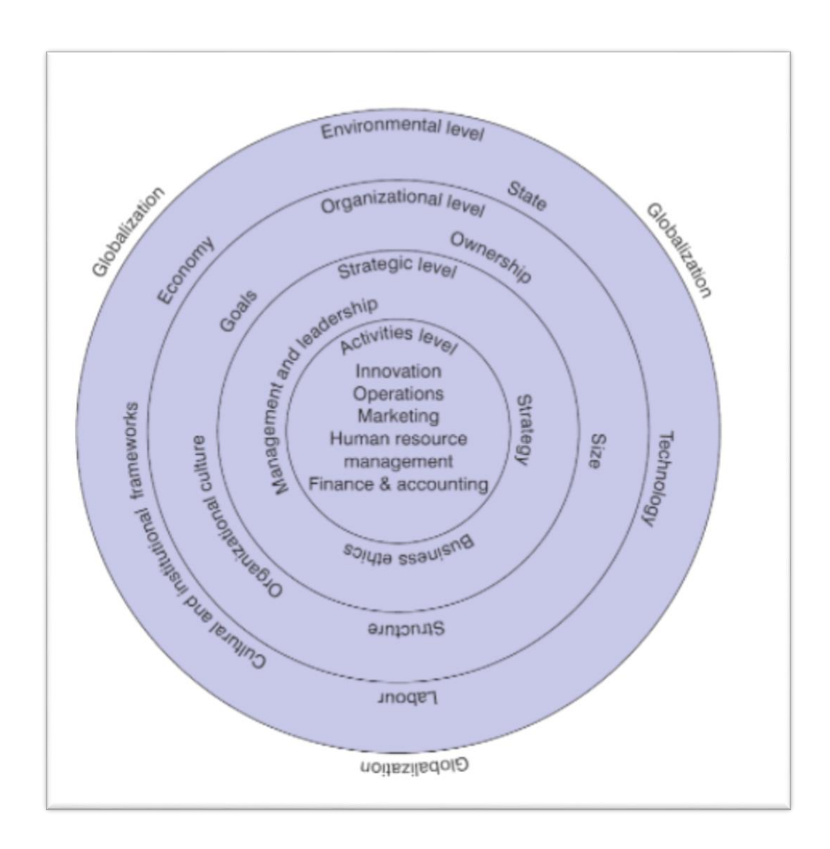
Figure 2- Business in different Levels

Of course, the economic performance of an individual business is influenced by multiple different factors. Beside the more obvious ones, such as financial aspects, a business' culture is also often identified as an important issue impacting the effectiveness of companies. This opinion is among others shared by Casson (1991), who acknowledges that "An effective culture has a strong moral content. Morality can overcome problems that formal procedures- based on monitoring compliance with contracts- cannot. A strong culture therefore reduces transaction costs and enhances performance- the success of an economy depends on the quality of its culture" (p.3).